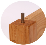
Bed Post Pin

4. Move upper bed into Trundle position with longest posts pointing down.